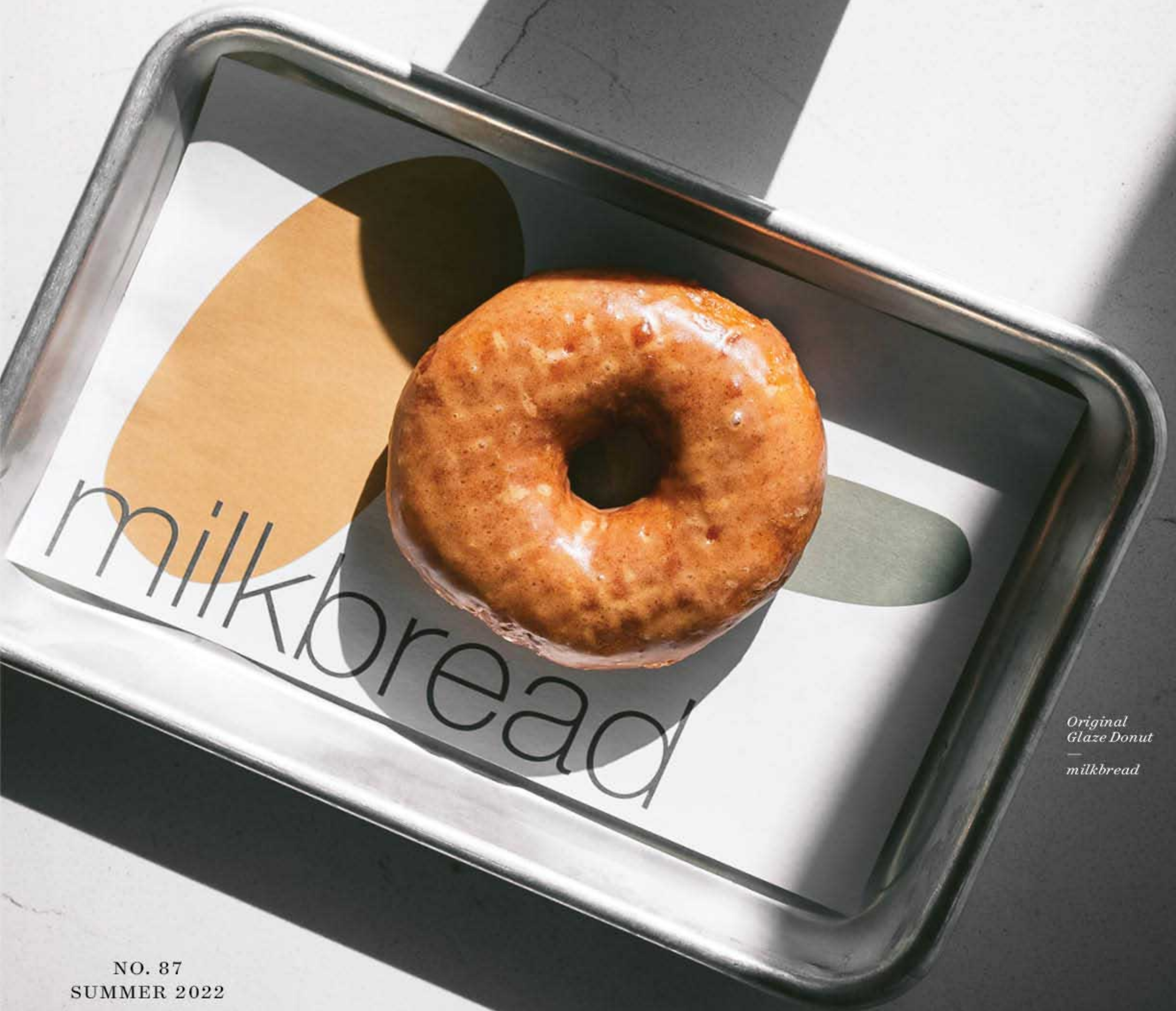
Original Glaze Donut — milkbread

The Best New Restaurants You Have To Try.